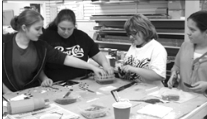
The next generation of glass artists hard at work in our Kid's Mosaic Class

On May 9th we'll be having a Wild at Heart Suncatcher class. In this easy hands-on workshop, we'll be making a wild and whimsical heart suncatcher that would also make a perfect Mother's Day gift. No experience is needed for this class, but it promises to be fun and interesting for more experienced students as well. At the end of this class you'll end up with a charming piece that'll reflect your unique personality. You won't want to miss our Mosaic