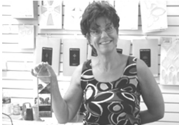
This student proudly displays her delightful Mystical Mini-Panel

To wrap up our summer offerings, we've added a Dragonfly Suncatcher Class to