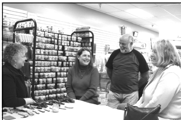
Even though we're super busy, we can always take time out to visit.

This class is only offered twice a year and space is limited so sign up early. Your pattern must be