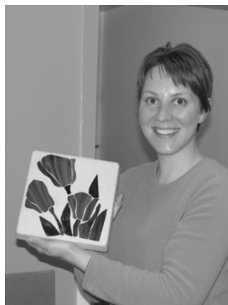
One of our happy students proudly displays her project

Very often, we hear people telling of busy lives, and overcrowded schedules and life