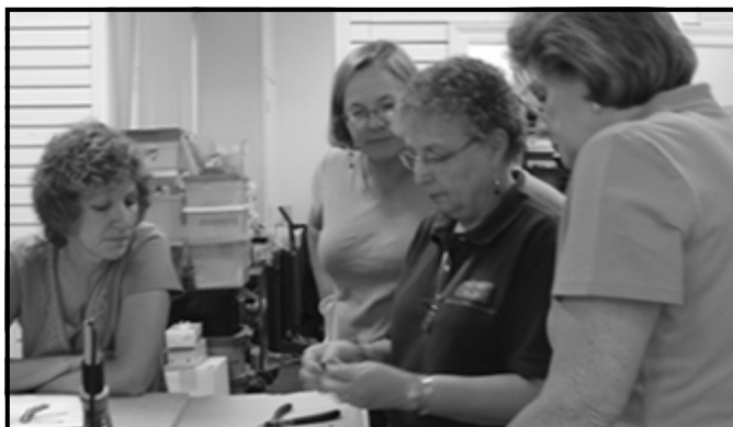
Nothing sparks creativity and learning quite like class participation.

We've started offering bead making classes on an individual basis. Classes are scheduled at a time that's convenient for both student and teacher. You can read all the details below. If bead making is something you are interested in learning how to do, then stop by the shop or give me a call.