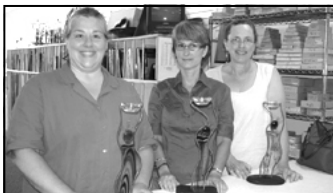
Students display their Goddess Candle Holders made in a recent class

Our regular Beginning Class and Workshop Class will be forming the first week of October and again in November. Keep in mind, we won't have our regular classes